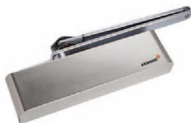
AR8500-L (Slimline Cover)